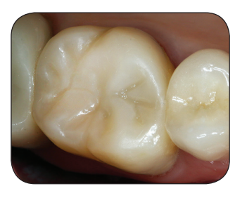
CAMouflage Now #3 at 8 months