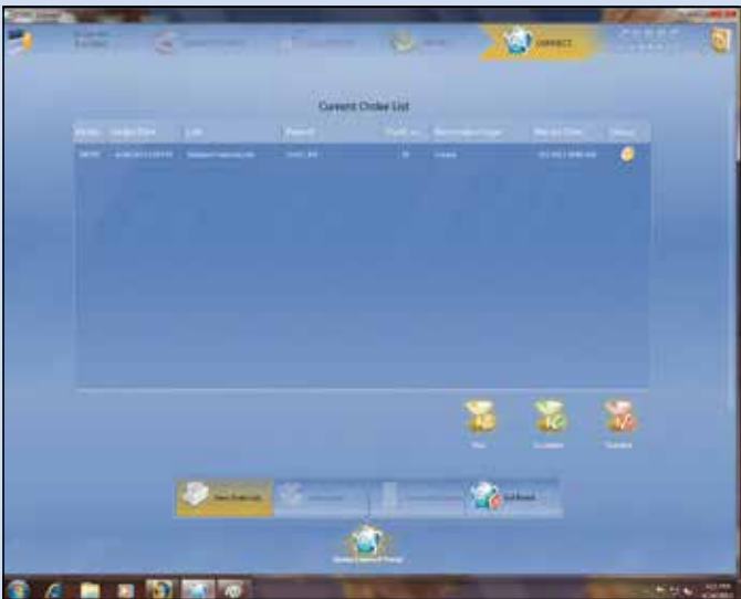
View of current order list