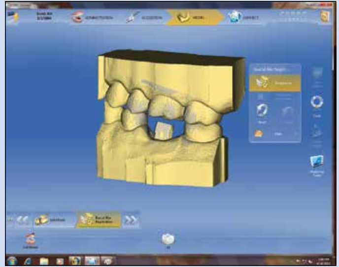
Bite has been established, click ">>"