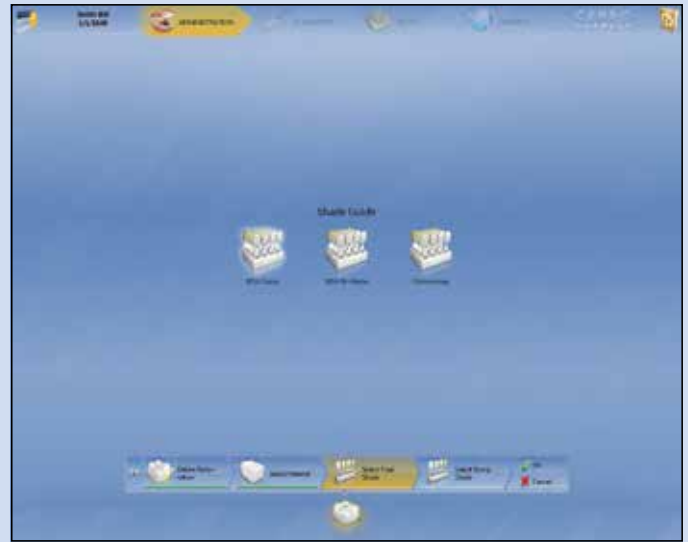
Select a shade guide