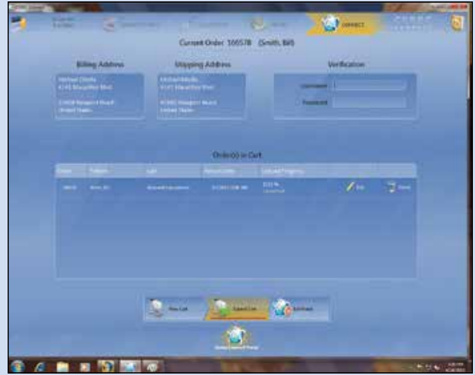
Re-enter user name and password, then press "Ok"