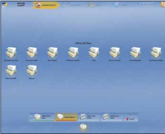
Highlight material for restoration, then click "Select Final Shade"