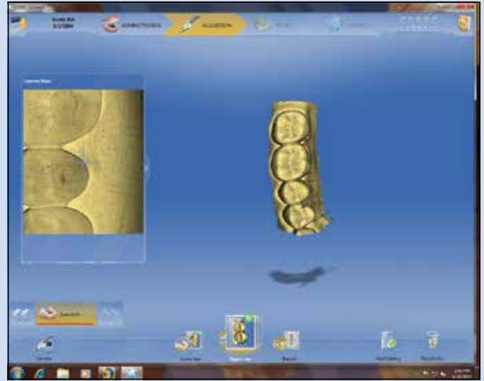
Completed opposing scan, press "Buccal" for buccal bite