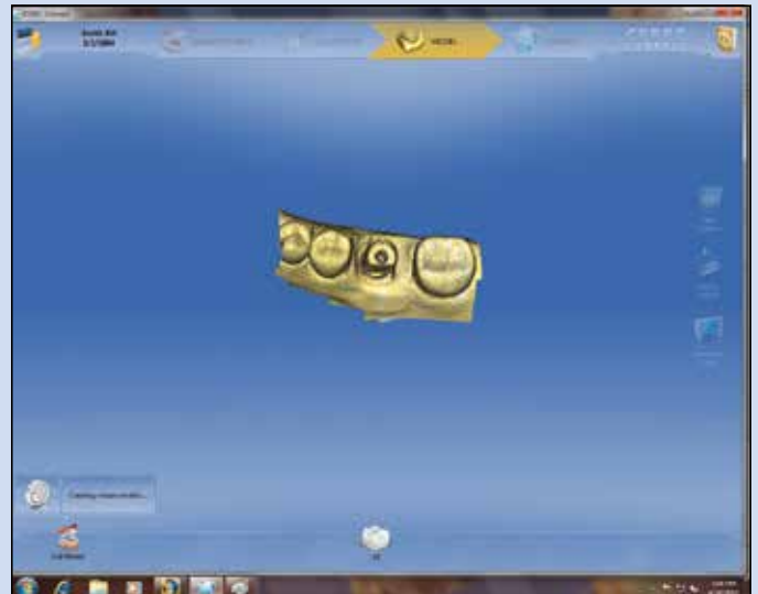
Image spins as it creates virtual model