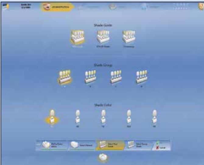
Select Shade, then click "Ok"