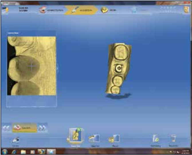
Scan prep arch, press "Upper Jaw" to scan opposing arch