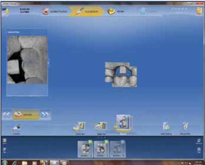
Press ">>" when bite scan is complete