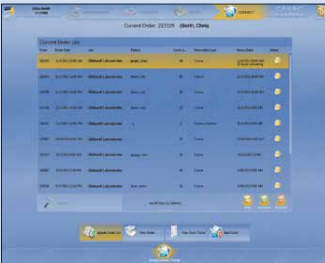
View of current order list