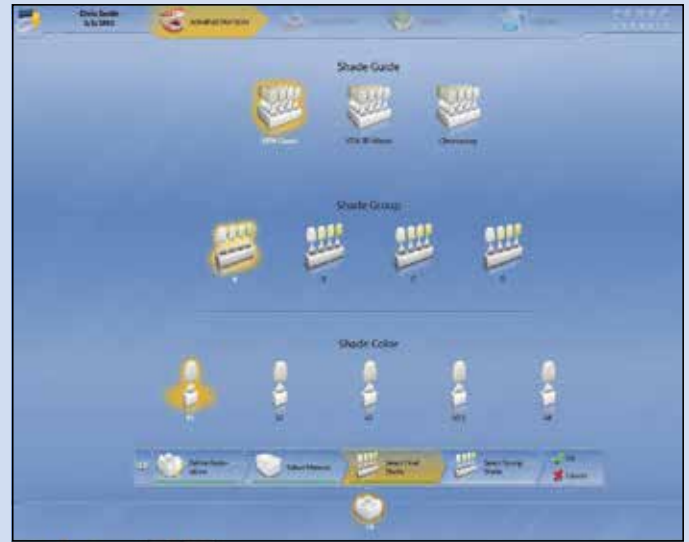
Select Shade Guide.