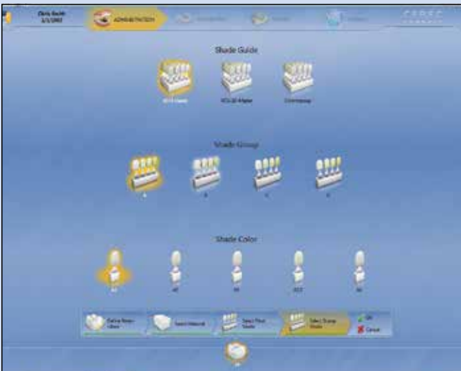
Select Shade Group and Shade Color, then click "Ok".