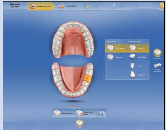
Verify and click ">>".