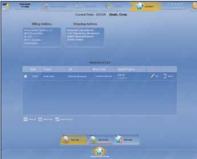
Click "Submit Cart".