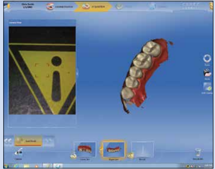
Complete opposing scan, then press "Buccal" and scan buccal bite.