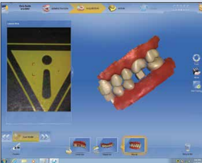
Press "➤➤" when bite scan is complete.