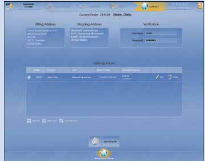
Re-enter user name and password, then press "Ok".