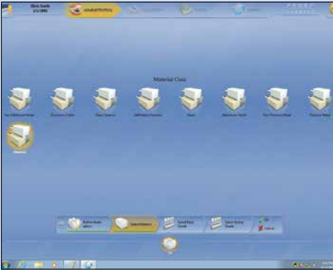
Highlight material for restoration, then click "Select Final Shade".