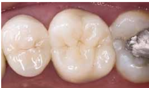
A Prismatic Clinical Zirconia crown was prescribed and the final results look beautifully natural.