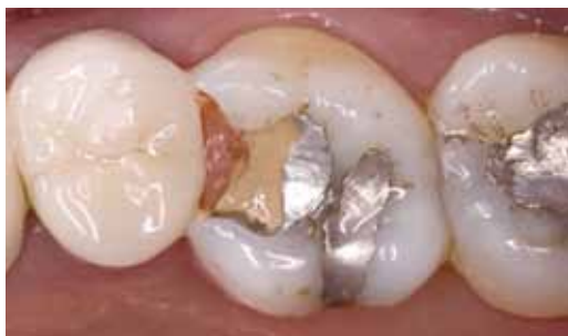
This molar tooth had a large silver filling that was fractured as a result of tooth decay.