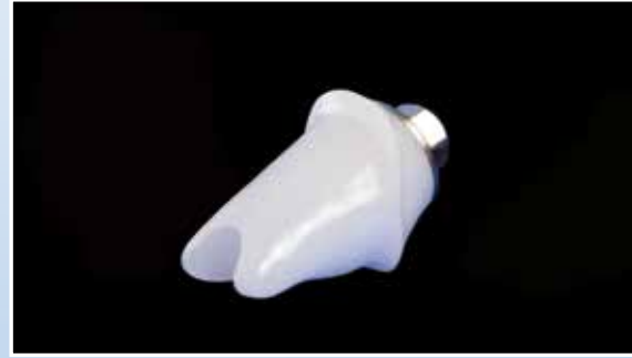
ZIRCONIA CUSTOM ABUTMENTS W/ TI-BASE