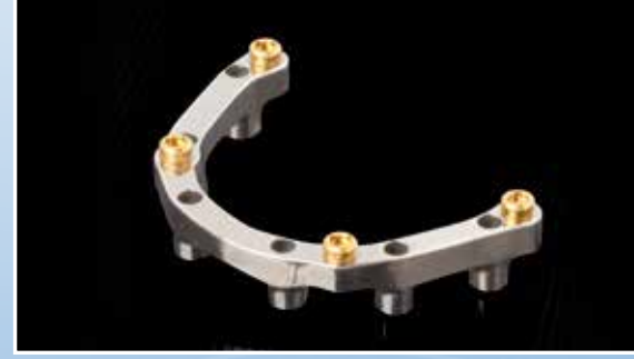
MILLED BARS & FRAMEWORKS