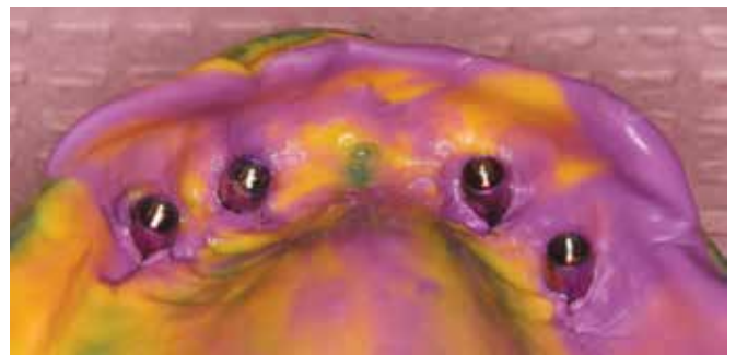
Figure 2: Reinsert impression copings into impression.