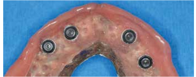
Figure 5: Final overdenture with Locator processing caps.