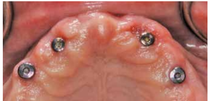
Figure 1: Remove the healing abutments.

Note: A Locator® Core Tool will be required for the next appointment. The torque wrench will be needed for final delivery. If you need Glidewell to provide a torque wrench, please indicate on Rx.