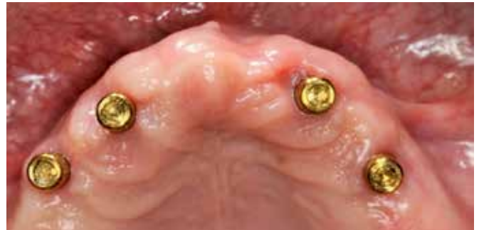
Figure 4: Seat the Locator abutments.