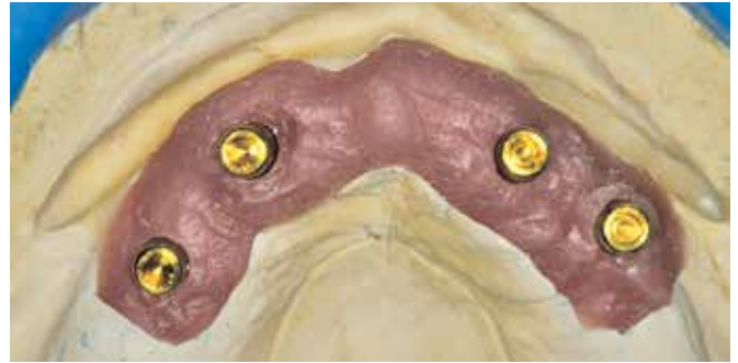
Figure 3: Master model with Locator abutments.