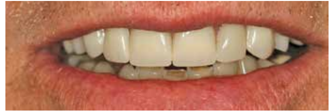
Figure 7: Confirm occlusion.