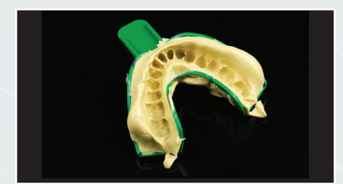
Take a VPS impression of the opposing arch.

Take a VPS impression of the edentulous arch.