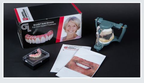
Return the wax setup and list any adjustments on the Rx.

Have questions? Call 866-861-7955 or check out our how-to video below.