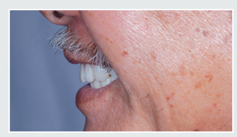
Confirm esthetics, phonetics and function.

☐ Hand-tighten the enclosed prosthetic screws, alternating from one side to the other. Confirm that the provisional implant prosthesis seats passively.