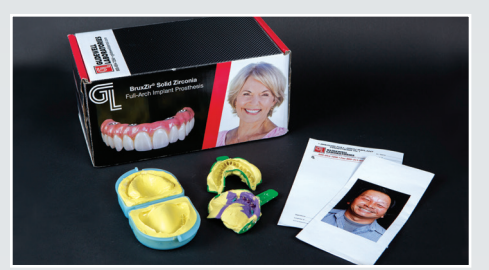
Send the impressions, completed Rx and a smile photo of the patient wearing existing denture or prosthesis to Glidewell.