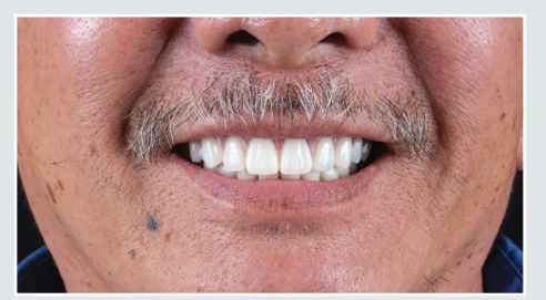
Take clinical photos of the smile.

NOTE: Before approving the wax setup and moving on to the Fourth Appointment, make sure the esthetics and occlusion are 100% correct and verified. Up to two provisionals implant prostheses are included with the complete service; any additional provisionals will incur a fee of $330 each.