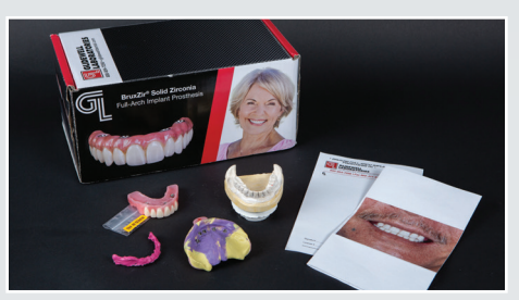
Return the case to Glidewell.

If the patient is wearing a fixed provisional, remove the multi-unit abutments and return them to their original positions on the master cast. Then, reinsert the prosthesis.