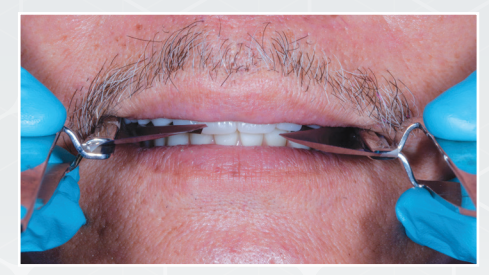
Confirm occlusion and make adjustments as necessary.