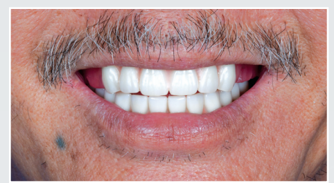
☐ Take clinical photos of the smile.