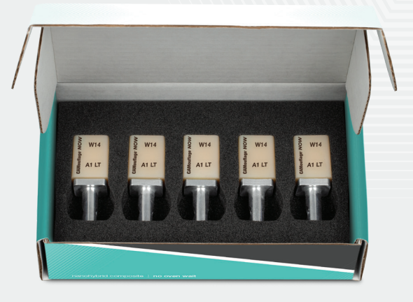
Sold in 5-block packs