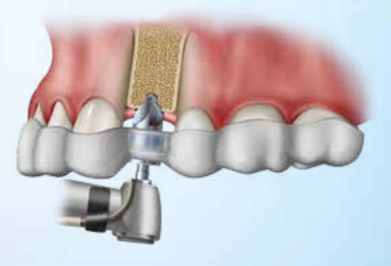
The Alignment Drill creates the initial osteotomy.