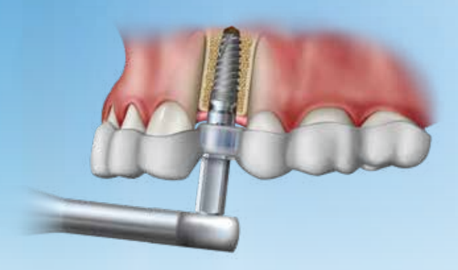
The Implant Mount is used to control the depth and set the rotation of the implant.