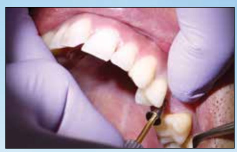
Excellent primary stability was evident, and a healing abutment was placed.