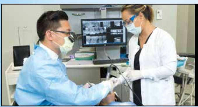
Take digital or physical impressions.