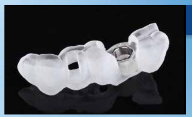
The case-specific surgical plan and guide are created.