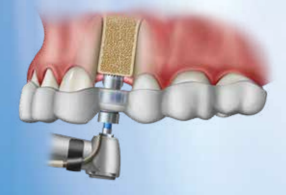
The surgical guide is seated, and the Tissue Punch exposes the bone.