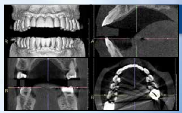
Obtain a CT or CBCT scan.