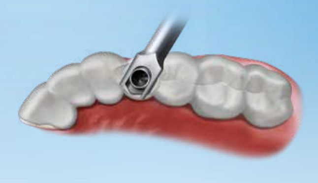
The Mount Wrench aids with final alignment prior to removal of the Implant Mount.