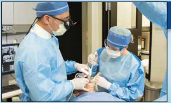
Perform guided surgery per the accepted treatment plan.