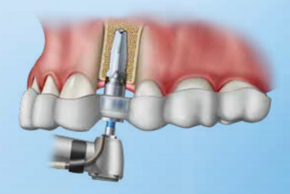
The Shaping Drill widens the osteotomy.