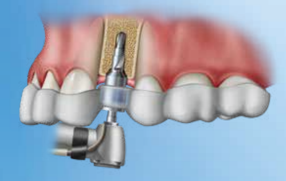
The Pilot Drill deepens the osteotomy.