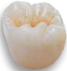
BruxZir® Solid Zirconia Crown