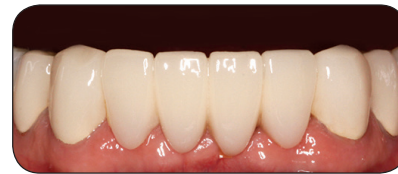
Figure 5. Obsidian Fused to Metal restoration (bridge at #22-28).