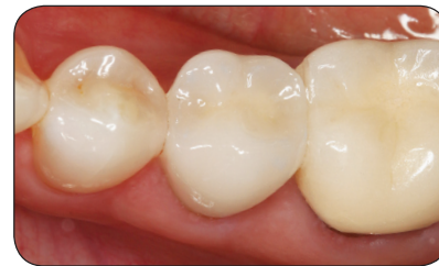
Figure 4. Obsidian Fused to Metal restoration (tooth #29) at six months.